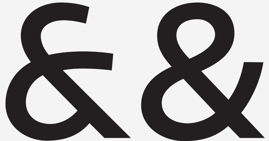
2 optional forms of ampersand in all fonts.